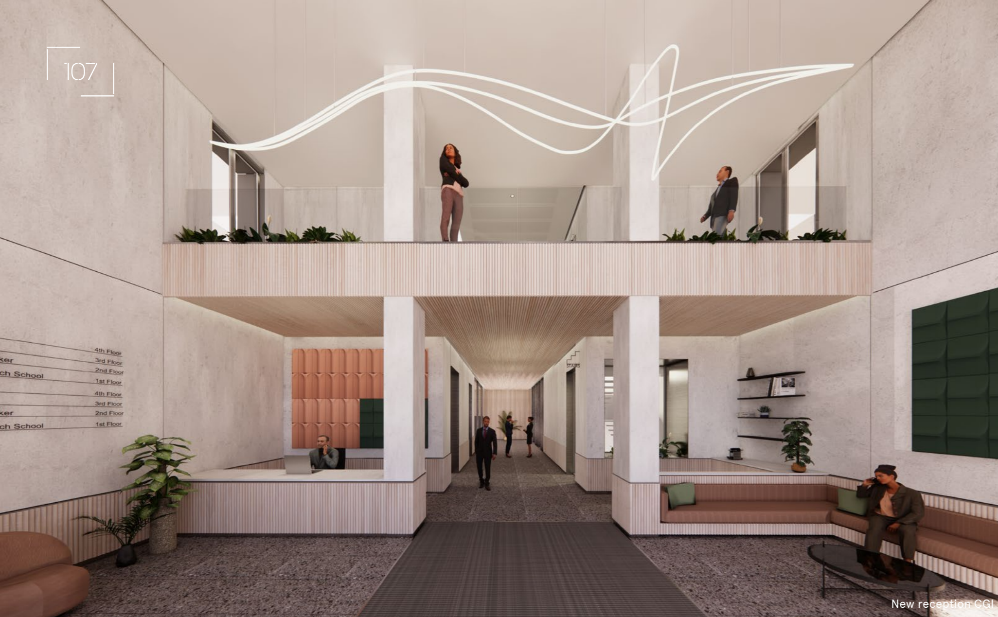
New reception CGI