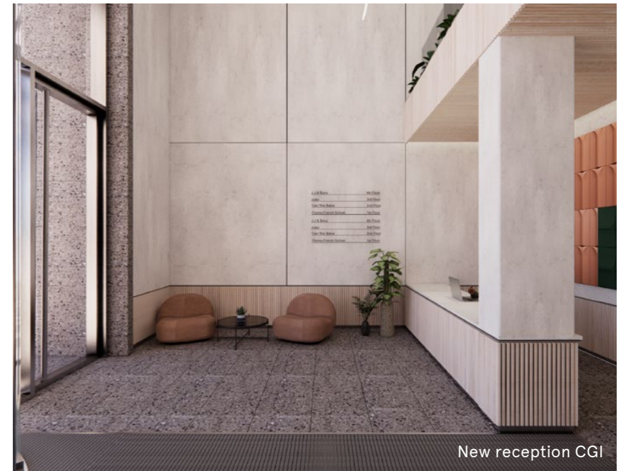
New reception CGI