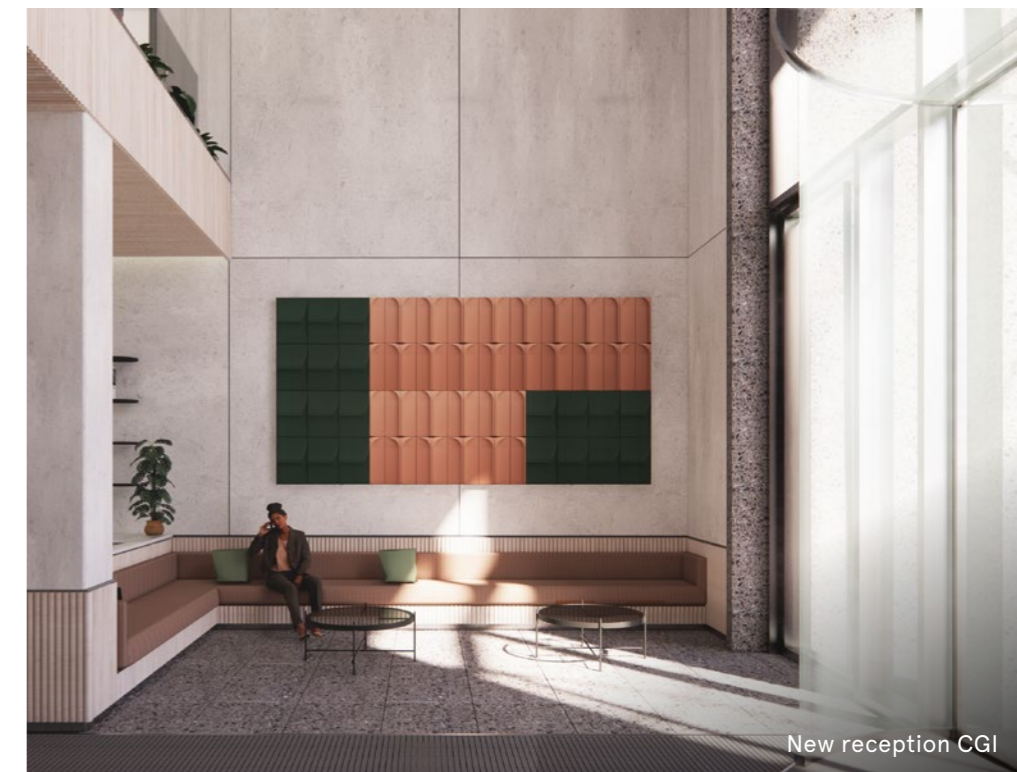
New reception CGI